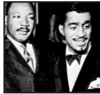
Martin Luther King, Jr. and Sammy Davis, Jr.

Opportunities for African Americans were once very limited in the United States. But from Sammy Davis Jr. to Oprah Winfrey to Colin Powell, African Americans have come to succeed in all fields—and to influence all parts of American culture. Search today's newspaper to find African Americans influencing news and culture in the categories below. Be sure to record on what page you found each person, and to write down his/her name when it is given.